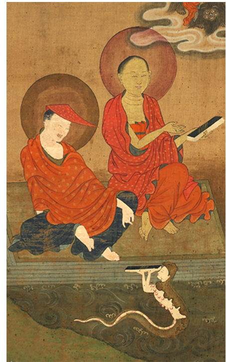
The Buddhist scholar Nāgārjuna and his disciple Āryadeva (Eastern Tibet, 19th c.)

Further and more detailed information about the Institute, its history, and its activities—including upcoming events—can be found at our website: https://www.oeaw.ac.at/ikga/ .